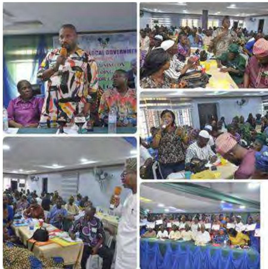
political office holders. The training which was organised by the department of Agriculture and social services, was aimed at equipping the newly elected excos of the 56 Community Development Associations in Mushin on how to perform