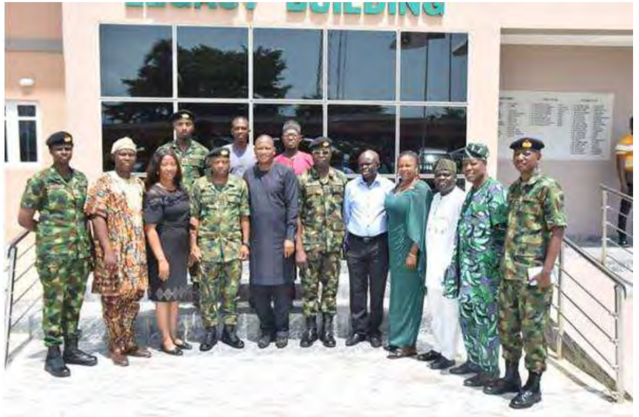
taken between and among critical stakeholders in Badagry local government as a border and coastal water bodies that serves as exit and entrance point to the country in checkmating human trafficking, smuggling, terrorism among other activities of security and economic saboteurs.