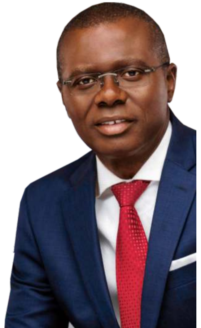
Mr. Babajide Sanwo-Olu

Smart city development is another area in which most cities delve into. However, in the light of this developmental